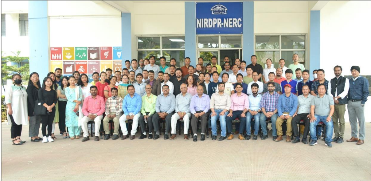
Training cum Workshop on eGramSwaraj Portal organised for North Eastern States

Training-cum-Workshop on e-GramSwaraj Portal for North Eastern States of India (March 15 - 19, 2021)